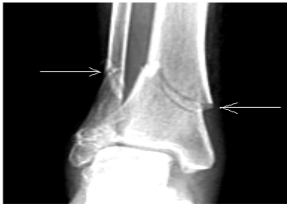
Fig. 03: Radiograph showing fracture of Tibia and Fibula